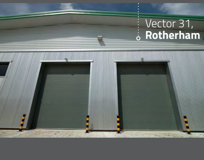
Vector 31, Rotherham