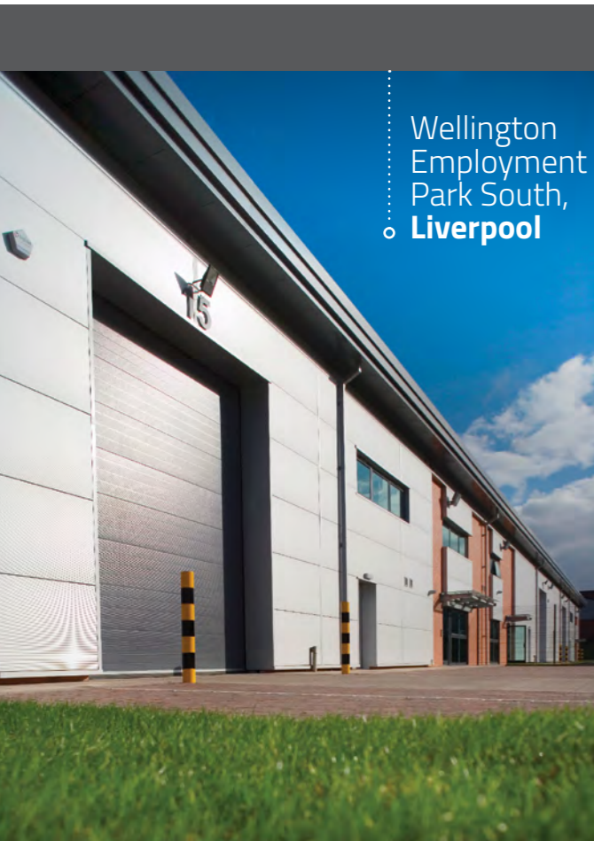
Wellington Employment Park South, Liverpool